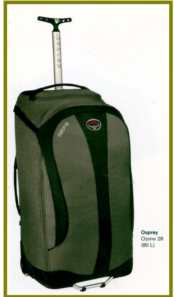
Osprey Ozone 28 (80 L)

The midsize Ozone offers greater volume for anyone that travels with extra gear. But even with all this added space, organization is still easy thanks to the numerous internal and external pockets. Osprey wisely adds three grab handles which simplify loading the bag onto conveyer belts and scales. Unlike some bags, the Ozone is surprisingly light, which helps ensure climbers avoid any excess baggage-weight fees.