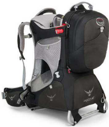
POCO AG™ PREMIUM