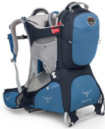
POCO AG™ PLUS